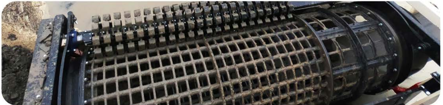
Drum Frame with Changeable Screens