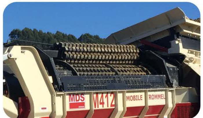
Drum Cleaning Kit