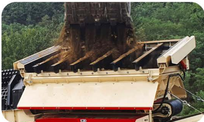
Heavy Duty Tipping Grid